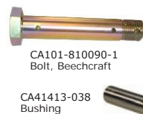
CA101-810090-1 Bolt, Beechcraft