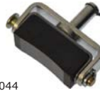
CA3044 Brush Block Assembly