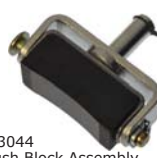
CA3044 Brush Block Assembly