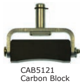
CAB5121 Carbon Block