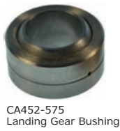
CA452-575 Landing Gear Bushing