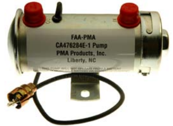
CA476284E Fuel Pump