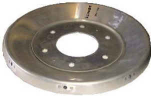
W35323-012 Front Bulkhead Spinner